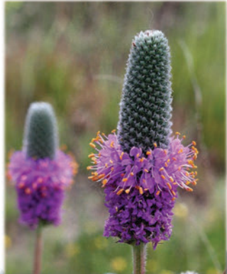
Purple Dalea 1