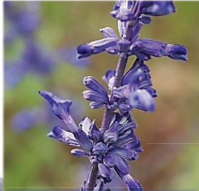
Mealy blue sage 2