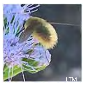
Bombyliid bee fly

Two wings Bristles or fine hair Short stubby antennae Indistinct body regions Eat nectar & detritus Mostly solitary