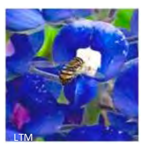
Syrphid hover fly