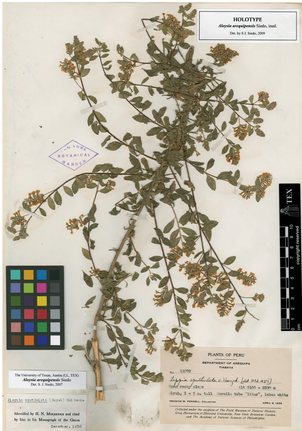
FIG. 1. Holotype of Aloysia arequipensis sp. nov. (NY).