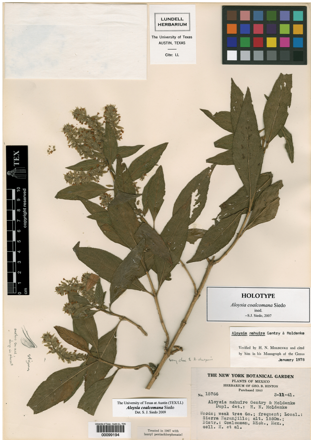
FIG. 2. Holotype of Aloysia coalcomana sp. nov. (LL).