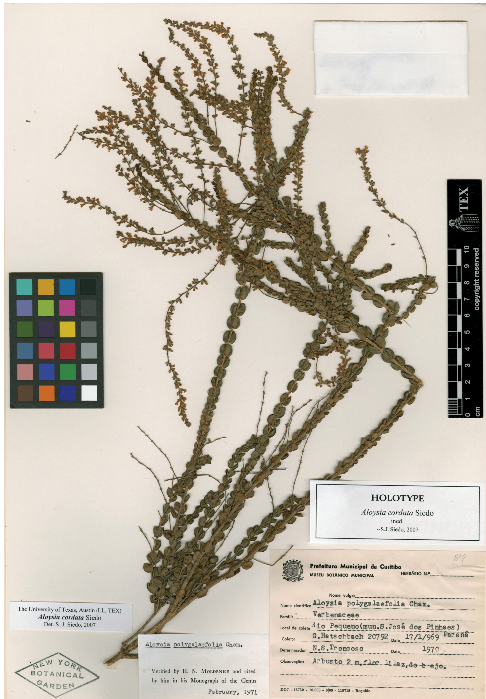
FIG. 3. Holotype of Aloysia cordata sp. nov. (NY).