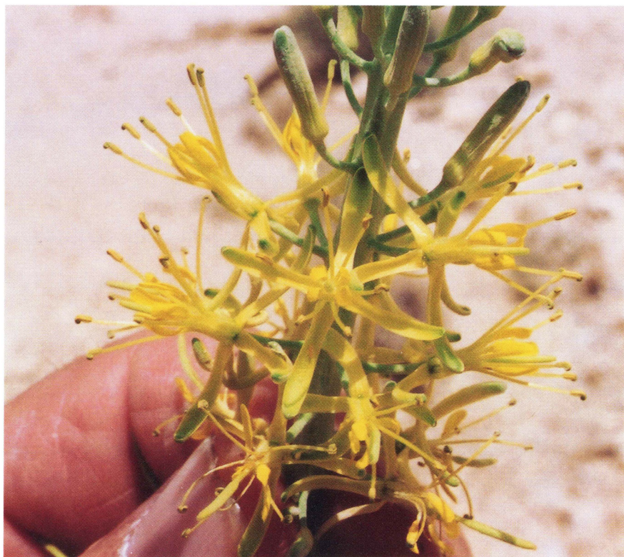
FIG. 3. Stanleya pinnata var. texana , flowers at anthesis.

1963, Correll & Wasshausen 27851 (LL, SRSC); W of Agua Fria Mt., 13 Apr 1936, Cory s.n. (GH); 6 miles NE of Agua Fria Springs, 13 Apr 1936, Cory 18569 (GH); Terlingua Creek, Sep 1883, Havard 70 (GH); desert washes near Terlingua, 1 Apr 1942, Nelson & Nelson 5027 (GH, TEX); 4.6 mi WSW along road to Agua Fria Mt., betonite clay hills with sparse vegetation, 11 Apr–26 May 1981, Powell 3604 (SRSC, TEX); Road to Agua Fria Mt., W of highway 181, 26 May 1984, Powell 4342 (SRSC, TEX); ca. 5 mi W of Highway 118 along Agua Fria 1985, Poole 2640a (TEX); common locally, 3.5 mi N of Terlingua, road, 18 Apr 1961, Rollins & Correll 6191 (GH, LL); 3 mi SE of Hen Egg Mt., 12 Jun 1949, Turner 1088 (GH, SRSC); N of Terlingua ca. 10 mi, 3 Apr 1938, Warnock C303 (GH, SRSC, TEX) gyp flats N of Agua Fria Mt., 31 Jul 1961, Warnock 18513 (SRSC, TEX).