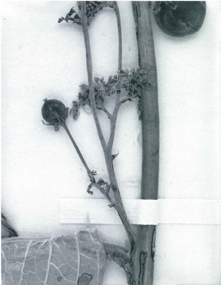
FIG. 3. Close up of bisexual glomerules with a central pistillate pedicel and paired dichasia of Phyllanthus grandifolius (Webster et al. 11268, DAV). \times 2 .

DISTRIBUTION AND HABITAT: The species is known only from the type collection, which lacks data except for the indication that it is from Colombia. In the enumeration of Mutis specimens of Blanco y Fernández de Caleyá (1991), Mutis 1902 is not listed, but localities of Mutis collections overall are summarized (in addition to the Bogotá area) as including Tolima (cabecera Mariquita) and Chocó, as well as collections in Ecuador by Caldas.