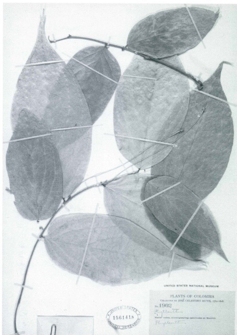
FIG. 1. Photograph of the holotype of Phyllanthus mutisianus (Mutis 1290, US 1561418).

Phyllanthoideae. The elongated slender fruiting pedicels suggest a possible affinity with Meineckia , but the seeds in the Mutis specimen, although immature, have a smooth testa very different from the arcuate seeds with foveolate testa found in Meineckia . Furthermore, in all species of Meineckia the staminate flowers are borne in condensed glomerules quite unlike the branching dichasia of the Mutis plant.