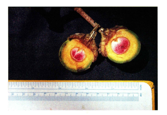
FIG. 2. Section of fruit and cupule of Ocotea heribertoi (from the type collection).

TREES to 40 m, diam. above buttresses to 90 cm; buttresses medium-sized but well developed; unweathered bark cream (bronze in smaller trees) with abundant spaced darker warts often more or less in vertical rows, in parts with darker exfoliating thick scales a few inches across; slash of bark aromatic, ca. 1 cm thick, in large trees pale to medium cinnamon-colored with fine vertical orange short lines (these not prominent), quickly oxidizing through a medium orange-brown to a medium chocolate-brown; sapwood yellowish-cream. YOUNG TWIGS smooth, sparsely to densely strigillose with distally-directed hairs to 0.1 mm long, usually soon glabrate, 1.5-3 mm thick, lightly ridged below petiole insertions; apical bud 3–5 mm long, lanceolate, densely minutely pale golden-silver sericeous; axillary buds of vigorous shoots with similar vestiture, lanceolate, laterally flattened, minute to 2.5 mm; older twigs grey, smooth to irregular, shiny where