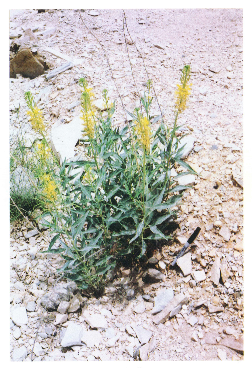
FIG. 2. Stanleya pinnata var. texana at type locality.

secondary inflorescences 20–30 cm long. PEDICELS ca. 1 cm long. SEPALS of mature buds (just before dehiscence) ca. 8 mm, elongating to 8–10 mm. PETALS 8–9(–10) mm long, the blades 4–5 mm long, the claws densely hispidulous, 4–5 mm long. STAMENS 6 (4 long and 2 short), the longer extending about 2 mm beyond the petals, hispidulous below. FRUITING PEDICELS ca. 1 cm long. PODS 5–8 cm long, torulose, gla-