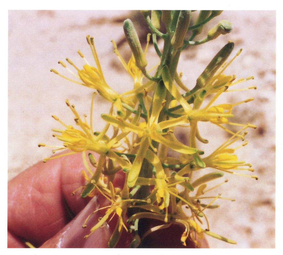
FIG. 3. Stanleya pinnata var. texana, flowers at anthesis.

1963, Correll & Wasshausen 27851 (LL, SRSC); W of Agua Fria Mt., 13 Apr 1936, Cory s.n. (GH); 6 miles NE of Agua Fria Springs, 13 Apr 1936, Cory 18569 (GH); Terlingua Creek, Sep 1883, Havard 70 (GH); desert washes near Terlingua, 1 Apr 1942, Nelson & Nelson 5027 (GH, TEX); 4.6 mi WSW along road to Agua Fria Mt., betonite clay hills with sparse vegetation, 11 Apr-26 May 1981, Powell 3604 (SRSC, TEX); Road to Agua Fria Mt., W of highway 181, 26 May 1984, Powell 4342 (SRSC, TEX); ca. 5 mi W of Highway 118 along Agua Fria 1985, Poole 2640a (TEX); common locally, 3.5 mi N of Terlingua, road, 18 Apr 1961, Rollins & Correll 6191 (GH, LL); 3 mi SE of Hen Egg Mt., 12 Jun 1949, Turner 1088 (GH, SRSC); N of Terlingua ca. 10 mi, 3 Apr 1938, Warnock C303 (GH, SRSC, TEX) gyp flats N of Agua Fria Mt., 31 Jul 1961, Warnock 18513 (SRSC, TEX).