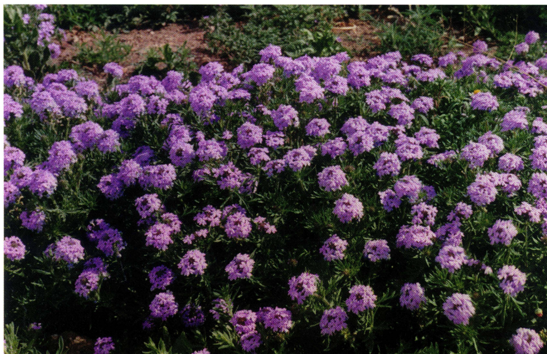
FIG. 11. Glandularia bipinnatifida var. ciliata (cf. Fig. 10).