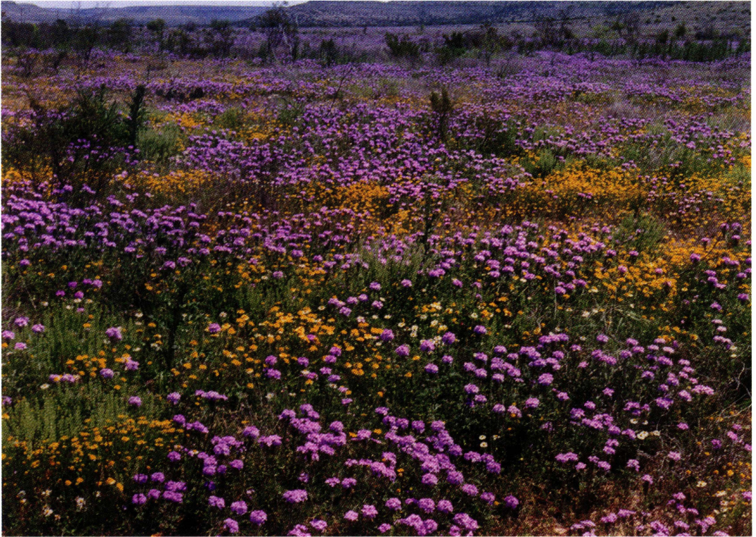
FIG. 8. Population of Glandularia bipinnatifida var. bipinnatifida ca 45 km northeast of Sanderson (Terrell Co., Turner 97-89).