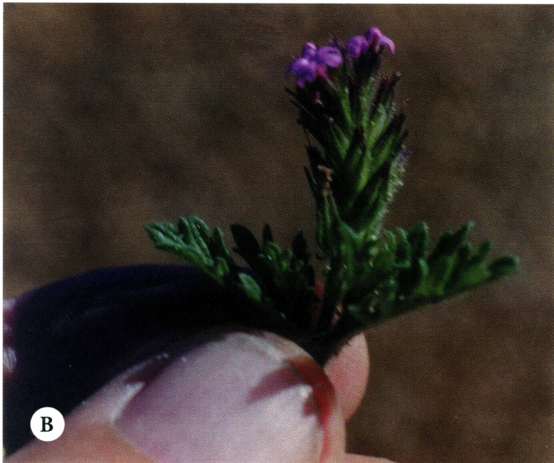
FIG. 12. Glandularia pumila (Brewster Co., Turner 96-215 [TEX]) a. showing prostrate growth; b. Close-up of raceme.