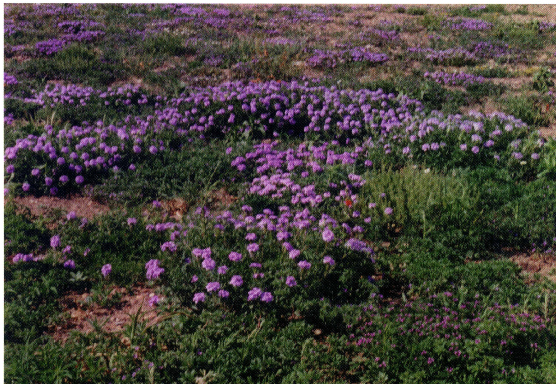
FIG. 10. Population of Glandularia bipinnatifida var. ciliata (Brewster Co., Turner 97-75.)