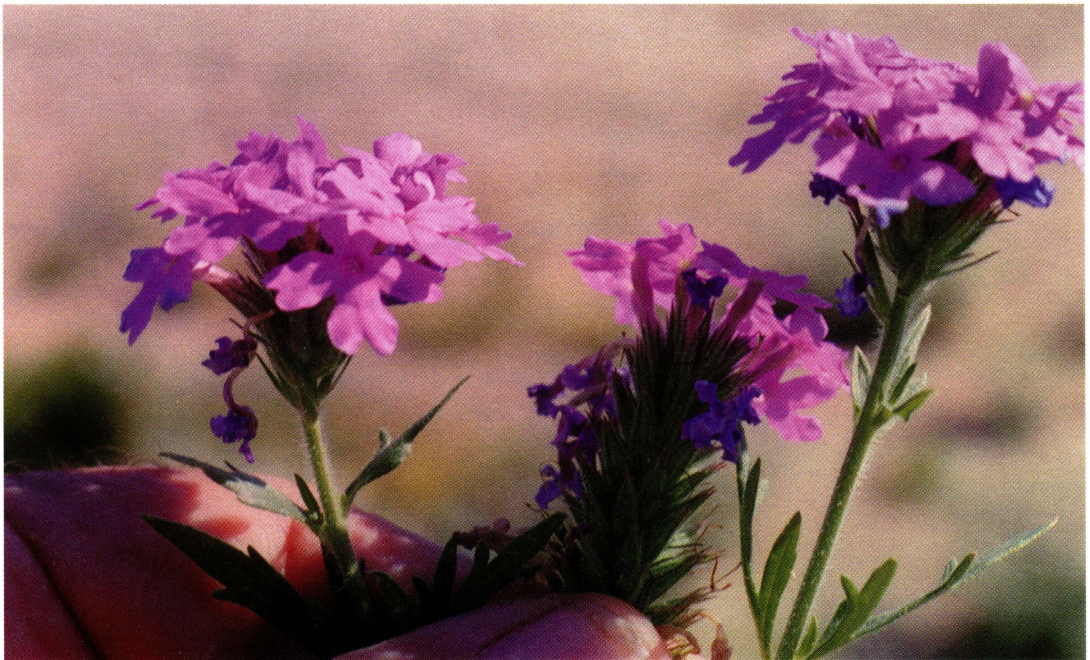
FIG. 9. Glandularia bipinnatifida var. bipinnatifida (cf. Fig. 8).