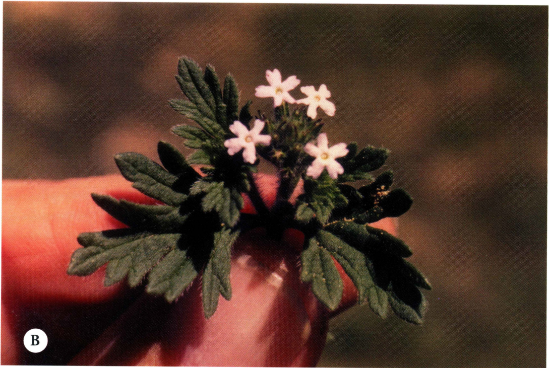
FIG. 13. Glandularia quadrangulata (Crockett Co. Turner 97-01 [TEX]). a. prostrate growth habit; b. Close-up of raceme.